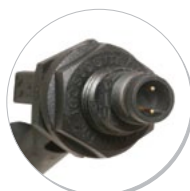
Level Switch LA36-M12

» For output connection with M12 plug (2 to 4 pins)